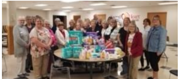
Court St. Monica #877, Norfolk, donated baby items for the local Birthright.