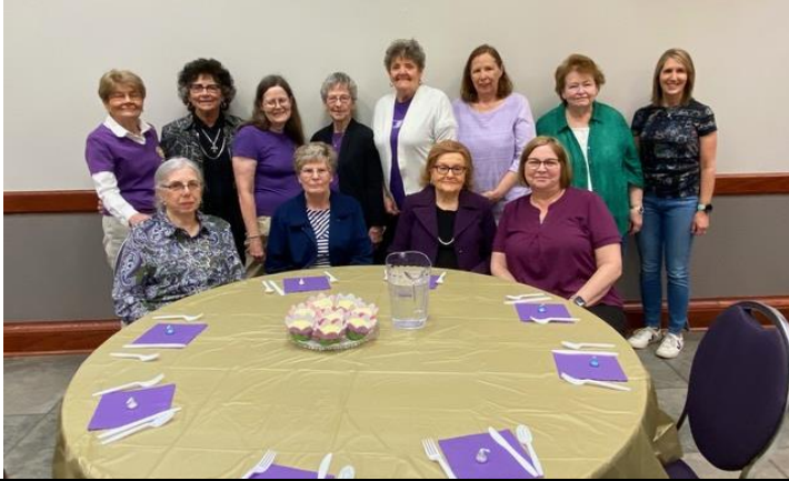
Court 2423 Mary Queen of Peace hosted the Golden Years Christmas luncheon. Over 110 guests were served and afterwards they played BINGO.

Would love to publish what is happening around the state.