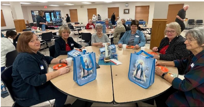
Court St. Monica #877, Norfolk, hosted a four-hour Marian retreat in October. Everyone received a bag of the Blessed Mother with holy cards and goodies inside.