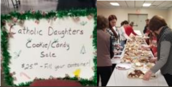
Court St. Monica #877, Norfolk, held their annual Christmas bake sale along with the Knights of Columbus religious vocation breakfast. Fill your containers $25.

Let us know, send in an article and pictures. Would love to publish what is happening around the state.