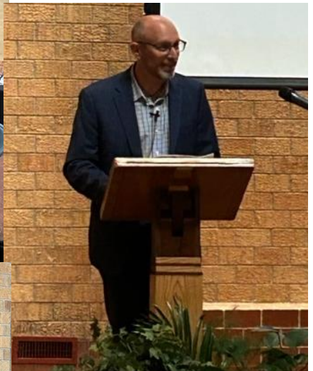
Each court is asked to make a $25 donation to the charity selected by the hosting court. This year's recipient was Vertus et Veritas, a summer camp program for boys.