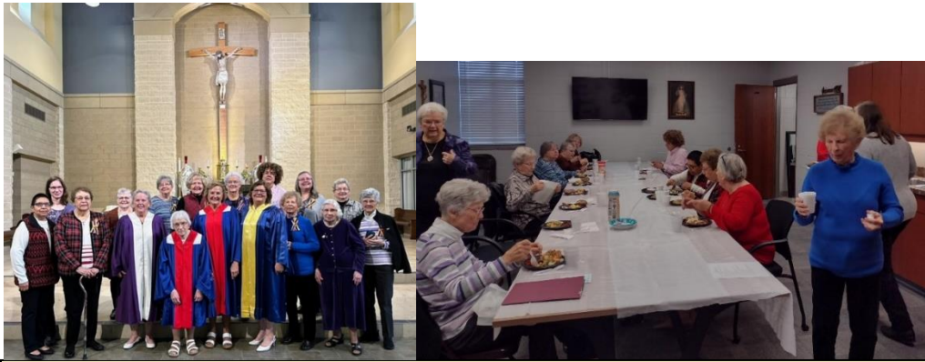
Court #472, St. Charles in Lincoln celebrated National CDA Day

What's Happening Around Nebraska? Celebrating something special? Let us know, send in an article and pictures. Would love to publish what is happening around the state.