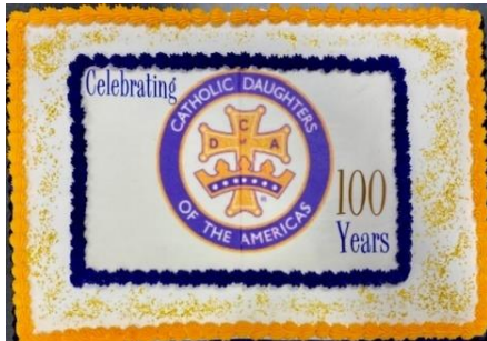
Court 697, St Michael in O'Neill celebrated the 100 th anniversary on Sunday, October 15

We would like to publish what is going on around the state.