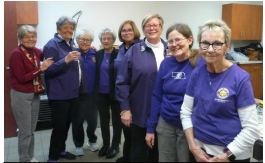
Members of Court #2423 served the Golden Years group for their Holiday Luncheon in December.