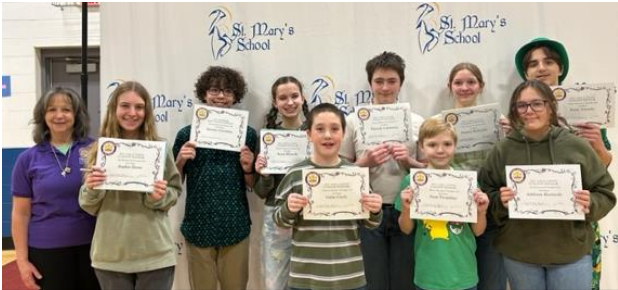
Court 2036, Our Lady of Perpetual Adoration, Bellevue presented awards to the winners of the 2023 Education Contest at St. Mary's School

Would love to publish what is happening around the state.